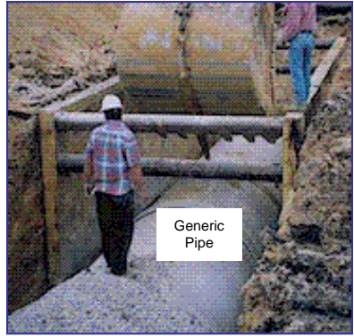
Collection system pipe sizes range from less than a foot to over three feet in diameter

The Bayou Duplantier Area Sewer Upgrades project includes upsizing of gravity sewer segments in the area of Perkins Road and Bayou Duplantier. These improvements are being made to alleviate upstream SSOs.