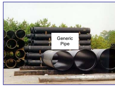
Approximately 970 linear feet of new 36inch gravity main will be constructed in the project area.