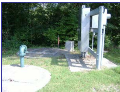
Pump Station #187, located on Clear Oak Avenue, near the intersection of Oak Meadow Drive, is being upgraded.