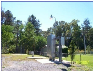
Pump Station #282, located on Regent Avenue, near the intersection of Trendale Drive, is being upgraded.