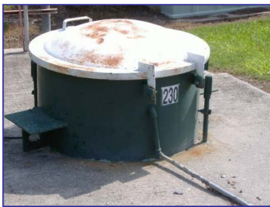
Pump Station #230, located at Morgan Meadow Avenue, near the intersection of Shoe Creek Drive, is being upgraded.

The purpose of this project is to replace PS230, PS282, and PS187 to alleviate SSOs at and near the pump stations. This project also includes the upsizing of the force mains from the three pump stations as well as the gravity sewer that feeds PS230.