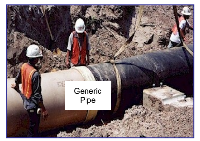
60-inch diameter forcemain will be installed in the project area.