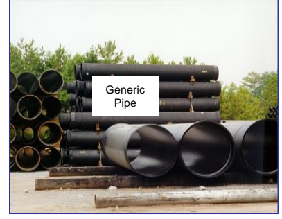
New forcemain will be constructed in the project area.