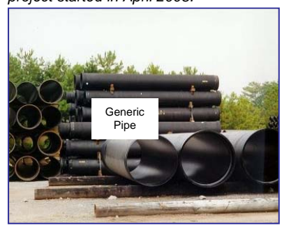
60-inch diameter force main will be constructed in the project area.