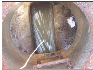
Design of the Staring Lane FM Phase II project started in April 2008.

This project includes the construction of a portion of the new force main from PS58 to the South WWTP. The purpose of this project is to relieve SSOs at PS58 as well as in the respective upstream and downstream basins. The construction of the direct force main from PS58 to the South WWTP alleviates the wet weather flows into existing downstream gravity pipe, and allows the capacity needed for future flows in the Staring Lane area. This project is being constructed simultaneous with the Green Light Plan's (GLP) roadwork.