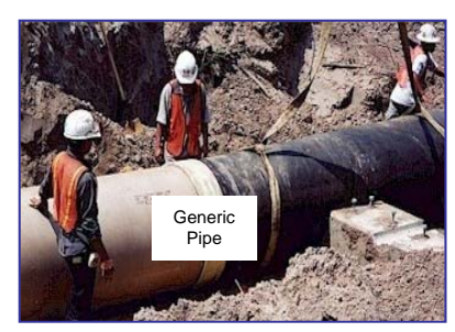
64-inch diameter force main will be constructed in the project area.