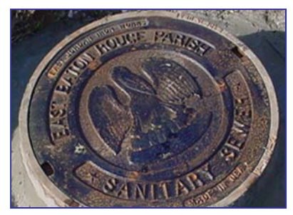
One of the first steps in rehabilitation includes a physical inspection of manholes and pipes to identify blockages.

Rehabilitation of the sewer collection system is a comprehensive physical process that begins with cleaning and inspection of sewer pipes and manholes. Typical rehabilitation repairs include pipe and manhole replacement and trenchless technologies that minimize above ground disturbances, such as curedin-place pipe liners.