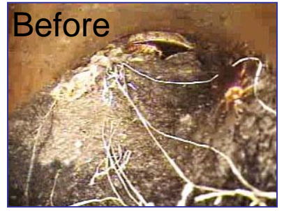
Simply cleaning the pipes and manholes in preparation for the physical inspection removes blockages, debris and roots.