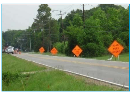
Signage notifies residents of underground construction activities.