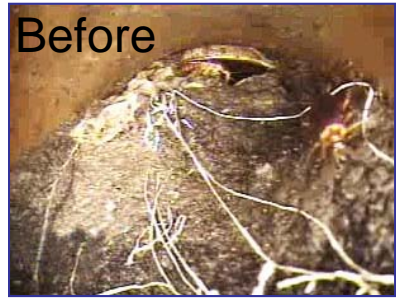
Simply cleaning the pipes and manholes in preparation for the physical inspection removes blockages, debris, and roots.