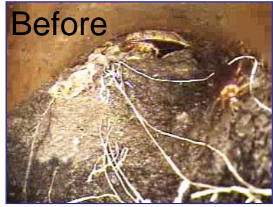
Simply cleaning the pipes and manholes in preparation for the physical inspection removes blockages, debris and roots.