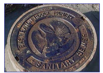
One of the first steps in rehabilitation includes a physical inspection of manholes and pipes to identify blockages.

Rehabilitation of the sewer collection system is a comprehensive physical process that begins with cleaning and inspection of sewer pipes and manholes. Typical rehabilitation repairs include pipe and manhole replacement and trenchless technologies that minimize above ground disturbances, such as cured-in-place pipe liners.