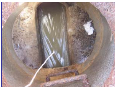
Flow measurements are taken throughout the collection system to determine the correct pipeline size.