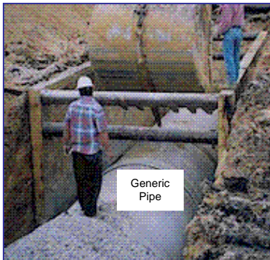
Collection system pipe sizes range from less than a foot to over six feet in diameter.

This project includes the upgrade of gravity sewers upstream of PS13, PS50, PS21, PS31, and PS101 to alleviate SSOs.