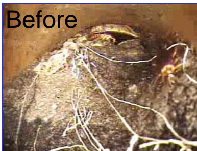
Simply cleaning the pipes and manholes in preparation for the physical inspection removes blockages, debris and roots.