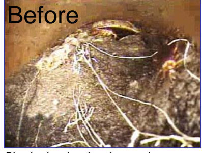
Simply cleaning the pipes and manholes in preparation for the physical inspection removes blockages, debris and roots.