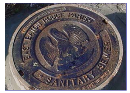
One of the first steps in rehabilitation includes a physical inspection of manholes and pipes to identify blockages.

Rehabilitation of the sewer collection system is a comprehensive physical process that begins with cleaning and inspection of sewer pipes and manholes. Typical rehabilitation repairs include pipe and manhole replacement and trenchless technologies that minimize above ground disturbances, such as cured-in-place pipe liners.