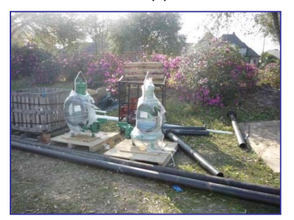
New submersible pumps wrapped from the factory and ready for installation into wet wells.