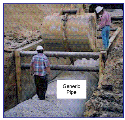
Collection system pipe sizes range from less than one foot to more than six feet in diameter.

This project includes the replacement of five pump stations and the upgrade of three pump stations. These will work in conjunction with the force main and gravity sewer upgrades in the North Gravity Basin to alleviate chronic SSOs in the basins upstream of the pump stations.