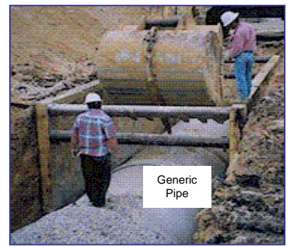
Collection system pipe sizes range from less than a foot to over six feet in diameter.

This project is primarily located north of Zachary with upgrades to the collection system near Baker included as part of that system upgrade. It is designed to alleviate chronic SSOs at the pump stations and increase the overall force main capacity.