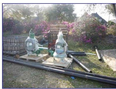
New submersible pumps wrapped from the factory and ready for installation into wet wells.