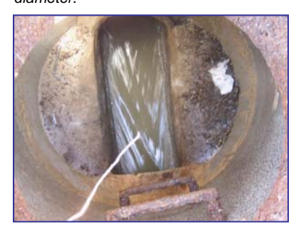
Flow measurements are taken throughout the collection system to determine the correct pipeline size.