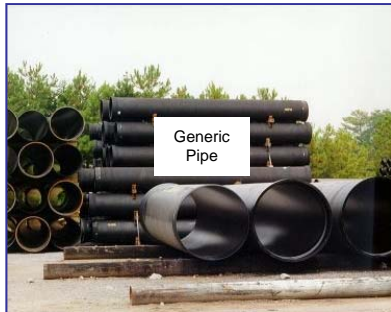
Sixty-five linear feet of 42-inch forcemain will be constructed in the project area.