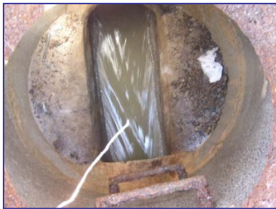
Approximately 16,000 linear feet of increased gravity sewer pipe will be constructed in the Plank Road – Kleinpeter Road project.

The purpose of this project is to upsize approximately 16,000 linear feet of gravity sewers upstream of PS45, PS127, PS44 and PS244 as well as 7,800 linear feet of force mains exiting PS38, PS244 and PS63 to alleviate chronic SSOs in the gravity sewer.