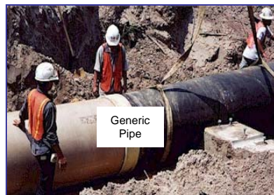
A total of 23,740 linear feet of gravity and force main will be constructed in the project area.