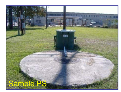
16 pump stations will be upgraded in the project area.