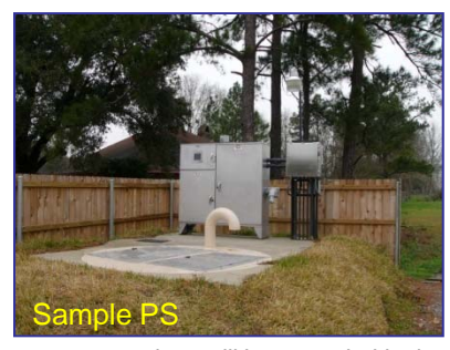
16 pump stations will be upgraded in the project area.