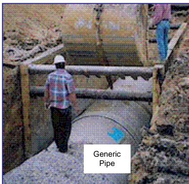
Collection system pipe sizes range from less than a foot to over six feet in diameter.

The project involves upsizing of gravity main to alleviate chronic SSOs at pump stations and increase the gravity main capacity. The force main upgrades will be developed to alleviate chronic SSOs at the pump stations and increase the capacity.