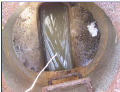
Flow measurements are taken throughout the collection system to determine the correct pipeline size.