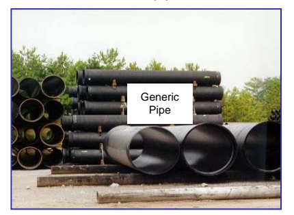
Approximately 5,600 linear feet of new 48-inch forcemain will be constructed in the project area.