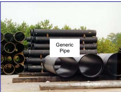
Approximately 4,100 linear feet of new 42-inch forcemain will be constructed in the project area.