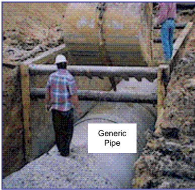
Collection system pipe sizes range from less than a foot to over six feet in diameter.

This project includes the upsizing of the gravity sewer upstream of PS16 and PS51 and the force main from PS16 and PS18, which is being upgraded as part of the Florida Blvd PS Improvements) project.