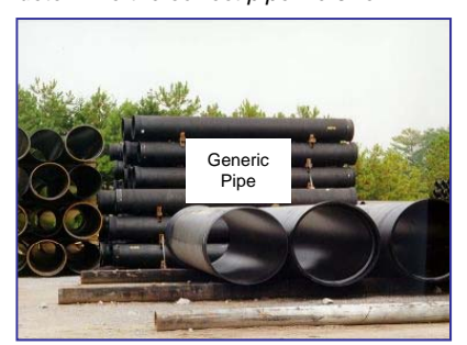
Approximately 5,600 linear feet of new 48-inch forcemain will be constructed in the project area.