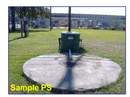
Five pump stations will be upgraded in the project area.