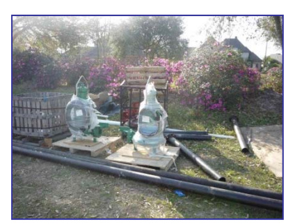
New submersible pumps wrapped from the factory and ready for installation into wet wells.