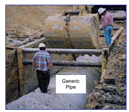
Collection system pipe sizes range from less than a foot to over six feet in diameter.

This project is primarily located north of Zachary with additional pump station upgrades north of the City of Baton Rouge. These upgrades are required to alleviate SSOs at and near the pump stations and their upstream basins.