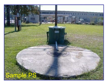
Six pump stations will be upgraded in the project area.