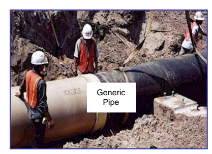
A total of 54,680 linear feet of various sizes of force main will be upgraded in the project area.