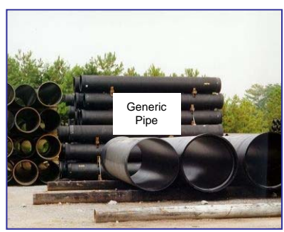
Approximately 450 linear feet of 12-inch gravity will be constructed in the project area