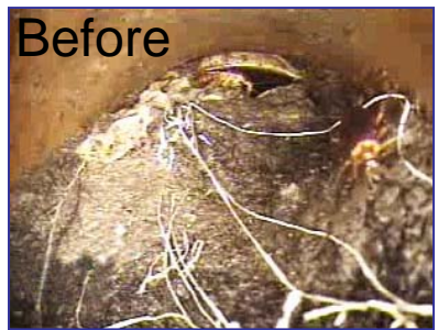
Simply cleaning the pipes and manholes in preparation for the physical inspection removes blockages, debris and roots.