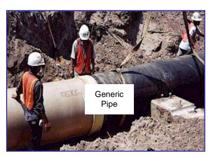
A total of 64,050 linear feet of various sizes of force main will be upgraded in the project area.