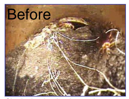
Simply cleaning the pipes and manholes in preparation for the physical inspection removes blockages, debris and roots.