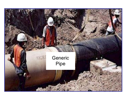
A total of 32,420 linear feet of various sizes of force main will be upgraded in the project area.