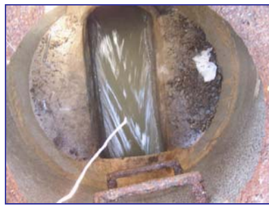
Flow measurements are taken throughout the collection system to determine the correct pipeline size.