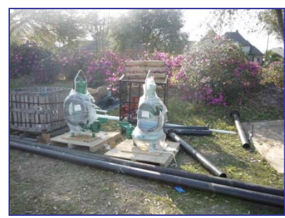
New submersible pumps wrapped from the factory and ready for installation into wet wells.