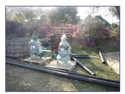
New submersible pumps wrapped from the factory and ready for installation into wet wells.