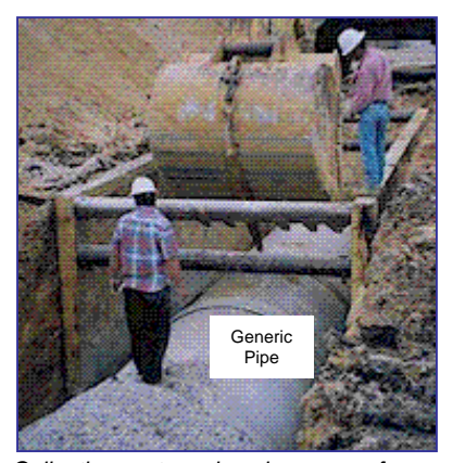
Collection system pipe sizes range from less than a foot to over six feet in diameter.

The Highland Road Pipeline Project includes pipeline segments from the intersections of Essen Lane and Lee Drive with Highland Road. It includes both upsizing of existing force main, and construction of new force main in order to alleviate upstream SSOs.