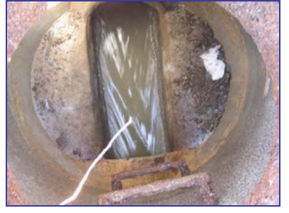
Flow measurements are taken throughout the collection system to determine the correct pipeline size.