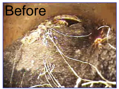
Simply cleaning the pipes and manholes in preparation for the physical inspection removes blockages, debris and roots.