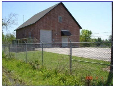
The force main at Booster Pump Station 514 (located at Burbank drive intersection) will be increased from 48" in diameter to 54" in diameter to accommodate flow.