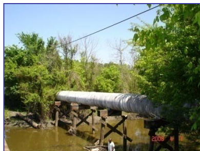
A total of 40,910 linear feet of 54-inch force main will be installed in the project area.