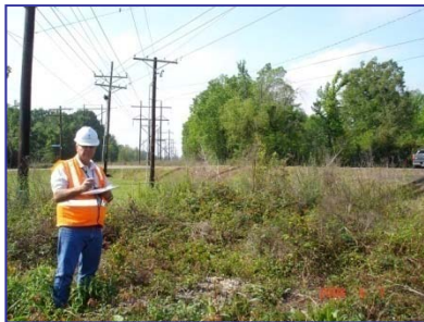
Design of the Highland Road – Burbank Drive project includes upsizing 42,590 linear feet of various sizes of forcemain.

This project includes the upsizing of force main in an area that extends north to the intersection of Jefferson Highway and Tiger Bend Road and continues south to the Staring Lane extension and Burbank Drive intersection. The upgrades are designed to alleviate chronic SSOs at the pump station and increase capacity.