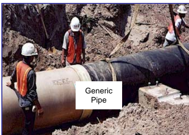
A total of 7,620 linear feet of various sizes of force main will be constructed in the project area.