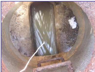
Design of the Highland Road – Buchanan Street project started in March 2008.

The purpose of this project is to upgrade gravity sewers upstream of PS1, PS2, and PS5 to alleviate SSOs in the Central Gravity South basin. The original project from the January 2008 PDP had several hundred feet of gravity sewer deleted from it with several hundred feet of force main added to it due to Central Consolidation, and was combined with the CGS-C-0005 (Stanford Avenue – Ferndale Avenue) project.