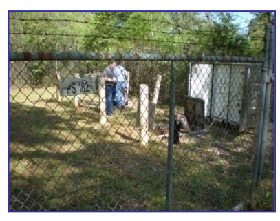
Pump Station #182, located near YMCA Plaza Drive will be replaced.

This project includes the replacement of seven pump stations that will work in conjunction with the force main upgrades in other South Forced Lower Basin projects to alleviate chronic SSOs at and near these pump stations.