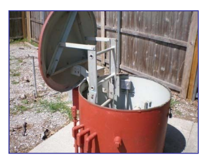
Pump Station #327, located at the intersection of Alder Drive and Crepe Myrtle Drive, will be replaced.