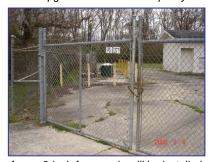
A new 8-inch force main will be installed starting at PS277 (located east of the end of Wright Drive) and will run north for 3,124 feet.