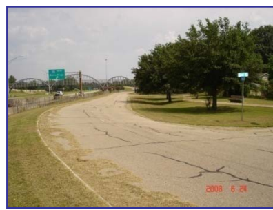
The design of Group 1B project consists of upgrading approximately 35,330 linear feet of force main