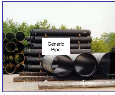
Approximately 12,270 linear feet of new 8 to 24-inch gravity main will be constructed in the project area.