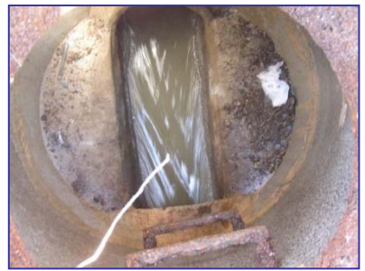
Design of the Government Street -South Acadian project started in August 2009.

This project includes the upgrade of gravity sewers upstream of PS3 and PS4 to alleviate SSOs in the vicinity.