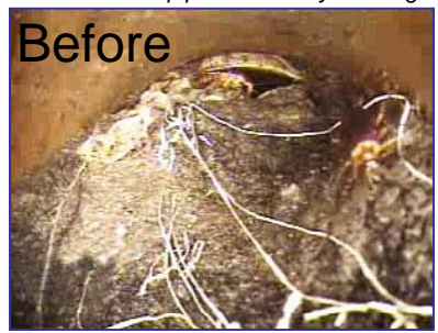
Simply cleaning the pipes and manholes in preparation for the physical inspection removes blockages, debris and roots.