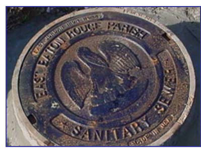
One of the first steps in rehabilitation includes a physical inspection of manholes and pipes to identify blockages.

Rehabilitation of the sewer collection system is a comprehensive physical process that begins with cleaning and inspection of sewer pipes and manholes. Typical rehabilitation repairs include pipe and manhole replacement and trenchless technologies that minimize above ground disturbances, such as cured-inplace pipe liners. Phase A includes open cut repairs and Phase B includes CIPP lining.