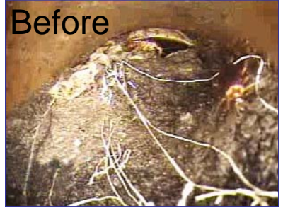
Simply cleaning the pipes and manholes in preparation for the physical inspection removes blockages, debris and roots.