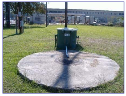
Pump Station #30, located on Tom Drive near the intersection of Dallas Drive, will be upgraded.