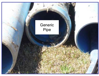
Approximately 7,360 linear feet of 16inch force main will be constructed in the project area.