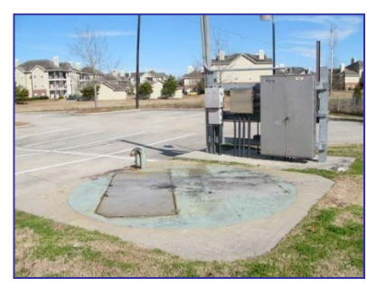
PS119, located on Citiplace Drive near the Movie Theater, will be upgraded.