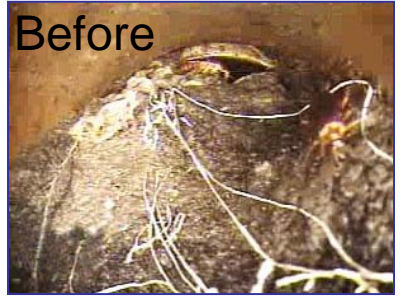
Simply cleaning the pipes and manholes in preparation for the physical inspection removes blockages, debris and roots.