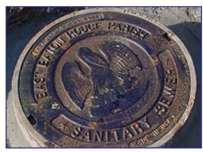
One of the first steps in rehabilitation includes a physical inspection of manholes and pipes to identify blockages.

Rehabilitation of the sewer collection system is a comprehensive physical process that begins with cleaning and inspection of sewer pipes and manholes. Typical rehabilitation repairs include pipe and manhole replacement and trenchless technologies that minimize above ground disturbances, such as curedin-place pipe liners.