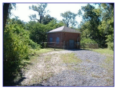
Pump Station #3, located at Acadian Thruway, near Bawell Street, will be upgraded.

The Central Consolidated pump station project involves the design and construction of nine pump stations, three of which (PS2, PS7, and PS10) will be interconnected and will discharge into PS5. PS5 will pump directly to the South WWTP via a new large force main following completion of construction of the South WWTP - Phase I project.