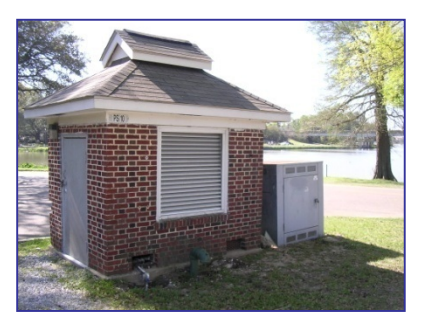
Pump Station #10, East Lakeshore Drive, near southeastern corner of City Park, will be upgraded.