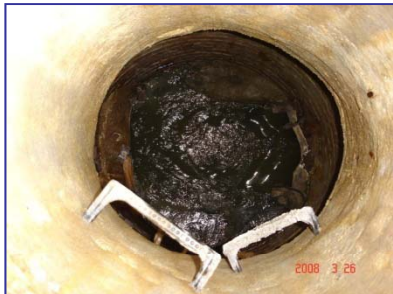
Manhole inspections provide insight into pipeline conditions in the project area.

The purpose of this project is to re-route flow from PS15 and PS19 so that they directly pump through a common force main and manifold with the force main from to PS60 to increase the capacity of the system. The new PDP adds construction of gravity segments to improve constructability and scheduling issues.