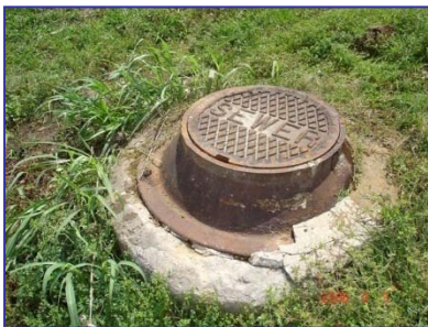
Gravity main and forcemain will be upgraded in the project area.