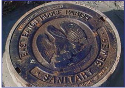
One of the first steps in rehabilitation includes a physical inspection of manholes and pipes to identify blockages.

Rehabilitation of the sewer collection system is a comprehensive physical process that begins with cleaning and inspection of sewer pipes and manholes. Typical rehabilitation repairs include pipe and manhole replacement and trenchless technologies that minimize above ground disturbances such as cured-inplace pipe liners.