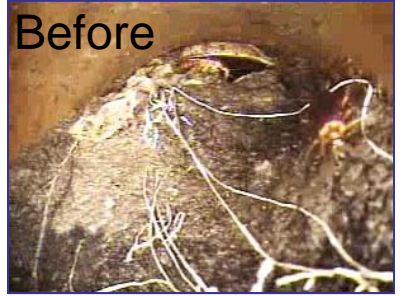
Simply cleaning the pipes and manholes in preparation for the physical inspection removes blockages, debris and roots.