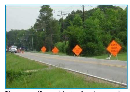
Signage notifies residents of underground construction activities.