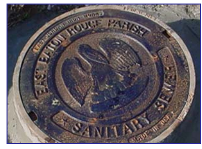
One of the first steps in rehabilitation includes a physical inspection of manholes and pipes to identify blockages.

Rehabilitation of the sewer collection system is a comprehensive physical process that begins with cleaning and inspection of sewer pipes and manholes. Typical rehabilitation repairs include pipe and manhole replacement and trenchless technologies that minimize above ground disturbances, such as curedin-place pipe liners.