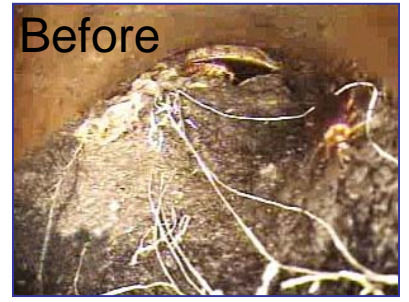
Simply cleaning the pipes and manholes in preparation for the physical inspection removes blockages, debris and roots.