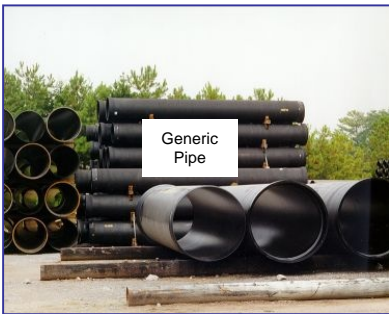
Approximately 12,640 linear feet of new 42-inch force main will be constructed in the project area.