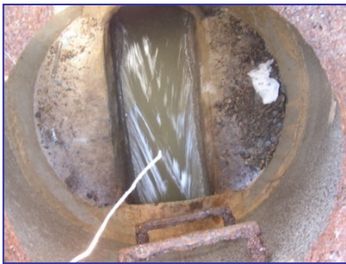
Design of the Central Consolidation – force main project started in November 2008.

This project includes the design and construction of the force main to convey flow from the Central Basin to the South WWTP thereby facilitating the closure of the Central WWTP. Phase II includes installation of 12,640 linear feet of force main.