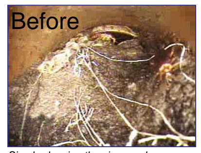
Simply cleaning the pipes and manholes in preparation for the physical inspection removes blockages, debris and roots.